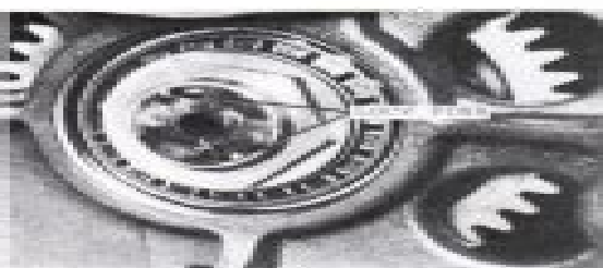
Fig. 259—Pinion nut lock pins should be driven in at counter-clockwise end of key slots as shown.

Two different ring and pinion sets have been used (7:36 and 8:41) on MF1105, MF1135 and MF1155 models. The reduction ratio is nearly the same (5.14:1 & 5.13:1) and either ratio may be installed, however, originally the 36 tooth ring gear is installed with 16 tooth side gears and differential pinions which are 2.95 inches (74.9mm) across tooth edges. The ring gear with 41 tooth was originally installed with 14 tooth side gears and differential pinions which are 3.33 inches (84.6mm) across tooth edges. On models with differential lock, both 3 and 5 plate type differential locks were used with 36 ring