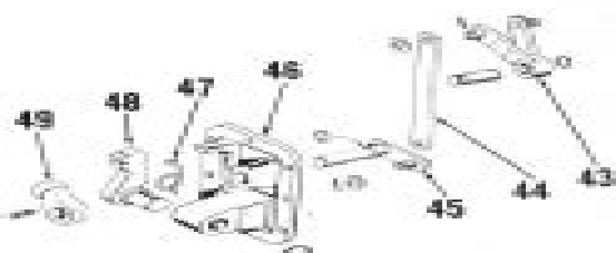
Fig. 260—Exploded view of park lock cover and associated parts. Park pawl (48) meshes with park gear (29—Fig. 246) on bevel pinion shaft.

43. Axle Assy. 44. Lock 45. Lever 46. Cover 47. Spring 48. Pawl