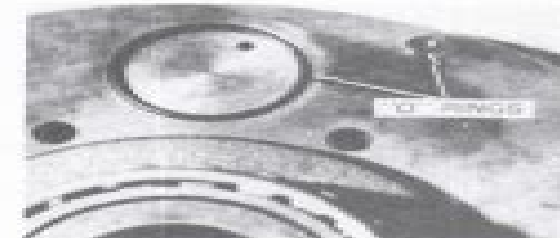
Fig. 263—Views showing the "O" rings located on inner surface of carrier bearing retainer plates. "O" rings seal brake fluid passages.