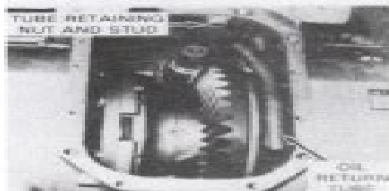
Fig. 261—The oil return tube shown above must be removed by removing nut and stud.