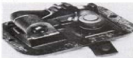
Fig. 260A—Assembled view of the park lock cover.

Working through rear opening in center housing, remove the oil return tube (Fig. 261) and block up between rim of main drive bevel gear and bottom of housing. Unbolt and remove both carrier bearing retainer plates and brake pressure plates as assemblies, allowing differential unit to rest on previously installed block. Roll differential and ring gear rearward from center housing as shown in Fig. 262. Overhaul the removed unit as outlined in paragraph 164.