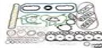
FULL GASKET KIT