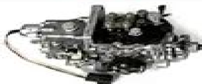
FUEL INJECTION PUMP