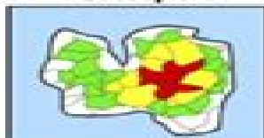
Isoline (ex: topographic)