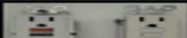
GFI Outlet Replacement