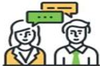
Discussion and Debate