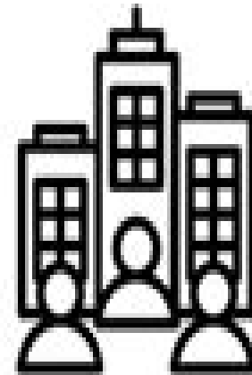
Individuals, business entities, nonprofit organizations, or government entities

A CPA or CA from a public accounting firm or self employed