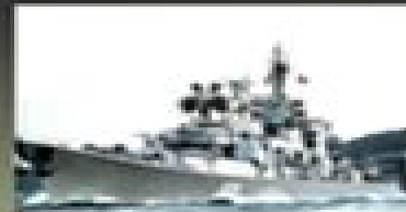
ILLUSTRATED BY PAUL WRIGHT