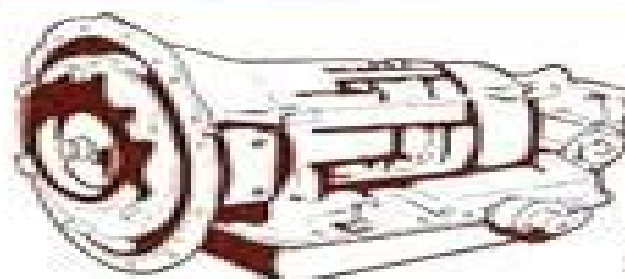
AT 500 SERIES

REMOVAL-INSTALLATION-MODULATOR ADJUSTMENT