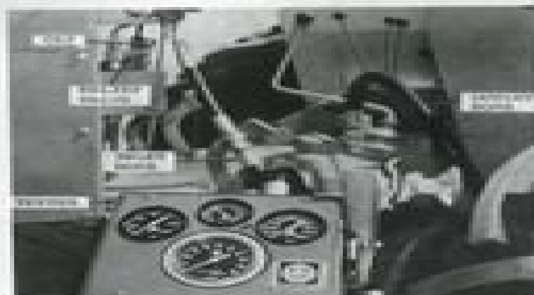
Fig. 7—Flow of 500 psi pressure-volume tester connected to steering power steering system on 180 and 185 models. It is necessary to bring upper reservoir return and add hose the tube slightly so that hose hose to lower can be attached. Make certain that upper end of tube in right and that "tee" fitting is capped before starting engine. Relief valve (A) located between the two "tee" fittings.

To check volume, open the valve on tester until pressure is approximately 1200 psi and observe the volume of flow. With engine operating at 1800 rpm, volume should be 5.25 gpm. If volume of flow is incorrect, the flow control valve (A) or pump should be serviced as outlined in paragraph 13B.