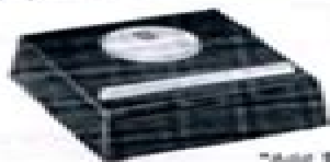
MODEL K-22 — pace-setter in economy plus style. Now with indicator light. Mahogany finish. Retail.....$24.50